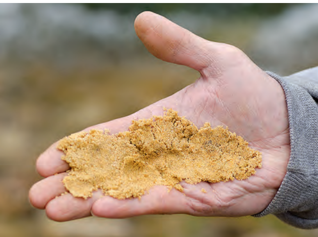
Jordan sandstone's relatively round grains of quartz (top) were shaped as winds blew the sand across the Earth's surface some 500 million years ago. Jordan sandstone aquifers are water-rich because loosely cemented grains of Jordan sandstone (above) act like a sponge.