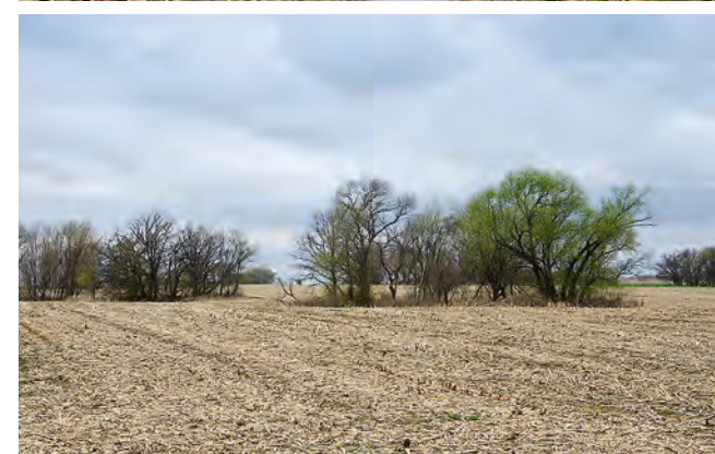
Green conducts a dye trace (top) at the bottom of a rubbish-filled sinkhole. Since the 1970s the practice of using sinkholes as dump sites has declined. Because the land around them can’t be farmed, large sinkholes (above) appear as islands of trees and vegetation.