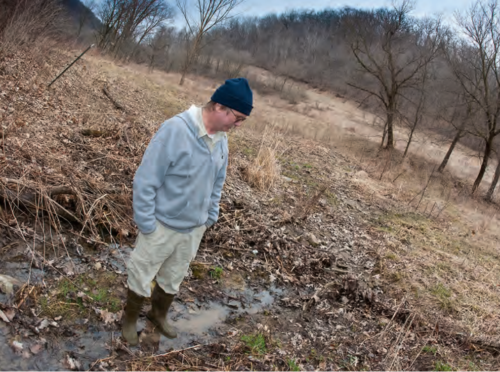
Green stands in the Campbell Creek valley where a small stream (above) sinks underground into the St. Lawrence formation. Green determined via dye tracing that water from this disappearing stream travels underground for about a mile before emanating from a boiling sand spring (opposite page) in the Lone Rock formation. The dye trace conducted at this location was the first to confirm Lone Rock springs are vulnerable to contamination from water sinking into the St. Lawrence formation.

has always been because we want to know more about it.”